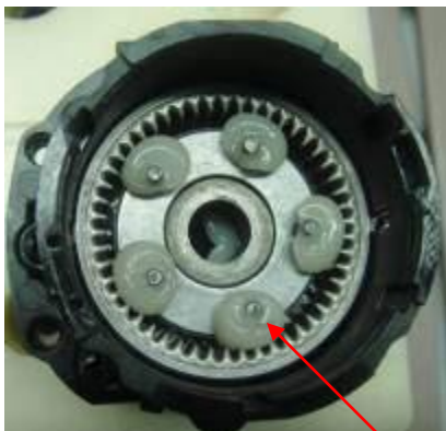
2nd Carrier Pin 1.0 \pm 0.2g

GRAPHICS SHOWN MAY REPRESENT VARIOUS MODS. SEE WINDCHILL B.O.M. FOR SPECIFIC COMPONENT USAGE.