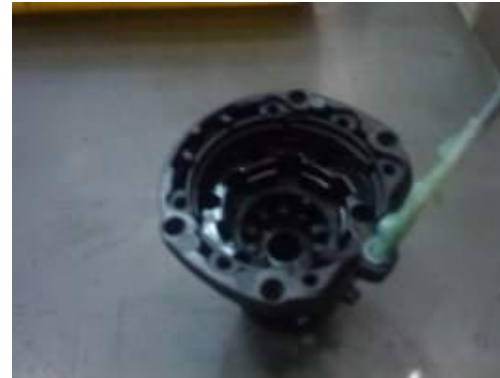
Hammer Clutch housing bushing hole No Control Qty

Supersedes CN: New Issue CN: CN0085090 Date Released: 11/18/2011