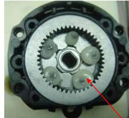
3rd Carrier Pin 1.0 \pm 0.2g