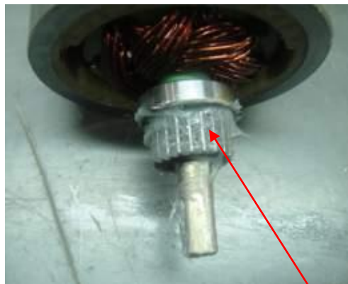
Motor Pinion 0.2 \pm 0.1g

GRAPHICS SHOWN MAY REPRESENT VARIOUS MODS. SEE WINDCHILL B.O.M. FOR SPECIFIC COMPONENT USAGE.