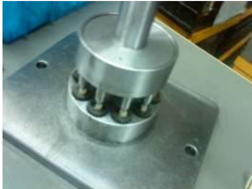
1st Plants No control Qty – Grease must fill holes

GRAPHICS SHOWN MAY REPRESENT VARIOUS MODS. SEE WINDCHILL B.O.M. FOR SPECIFIC COMPONENT USAGE.