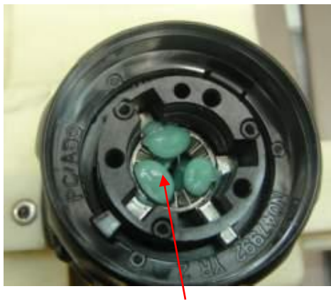
Lower Ratchet 0.3±0.1g – on ratchet

GRAPHICS SHOWN MAY REPRESENT VARIOUS MODS. SEE WINDCHILL B.O.M. FOR SPECIFIC COMPONENT USAGE.