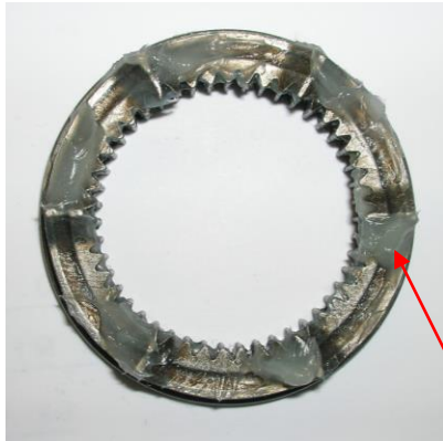
3rd Ring Gear Ramp 0.20 \pm 0.1g

GRAPHICS SHOWN MAY REPRESENT VARIOUS MODS. SEE WINDCHILL B.O.M. FOR SPECIFIC COMPONENT USAGE.